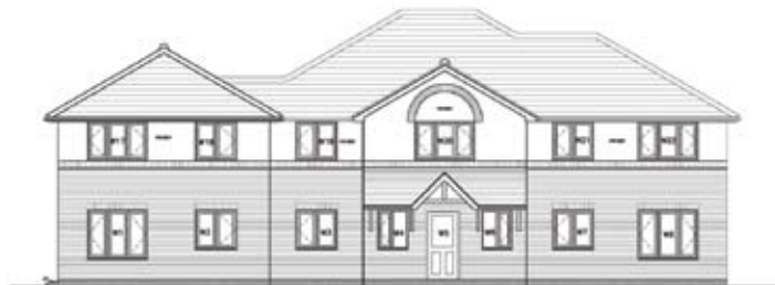
FRONT ELEVATION NW

This construction was enabled via a grant from The Homes & Communities Agency as a result of the support given by Aylesbury Vale District Council.