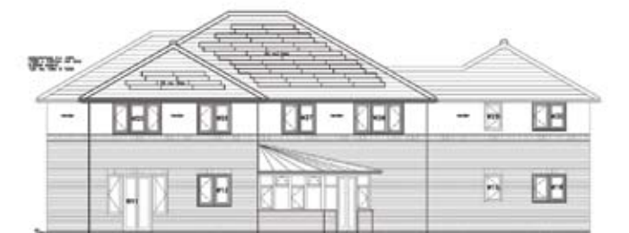
REAR ELEVATION SE

* The Code for Sustainable Homes is a tool to assess the environmental performance of new-build homes. It enables housing developers from the public and private sectors to measure and improve the design specification and construction quality of schemes against a unified nationally recognised rating, providing impetus for a step change in sustainable home building practice. The Code contributes to the achievement of sustainable development, which aims to provide a better quality of life, now and for future generations. The Code assists this by reducing the environmental impacts of the construction and use of our new homes, particularly the reduction of CO 2 emissions and climate change.