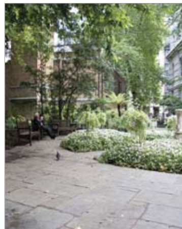
an example of a pocket park

Other ideas that are being considered to help 'green' the town centre include the possible creation of 'pocket parks' that would allow residents, shoppers, employees and visitors to sit, eat and rest around the town.